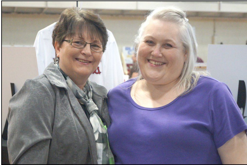
The Friends Foundation held their first "Taste of Ste. Genevieve" on Saturday night April 2nd. I believe it was a huge success and was enjoyed by all. Some of the Auxiliary volunteered for the evening and were glad to help.